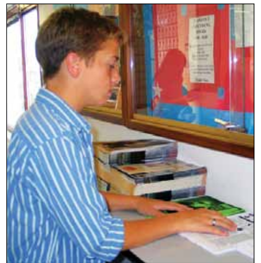
A summer hire student works at the MWR office. More than 70 jobs were offered to Caserma Ederle youth in 2009. (File photo)